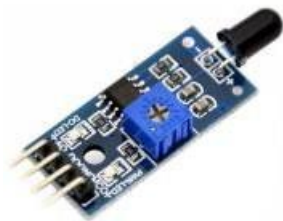
Fig : Flame Sensor

FLAME SENSOR: A flame detector is a sensor designed to detect and respond to the presence of a flame or fire. It also can detect ordinary light source in the range of a wavelength 760nm-1100 nm. The detection distance is up to 100 cm.