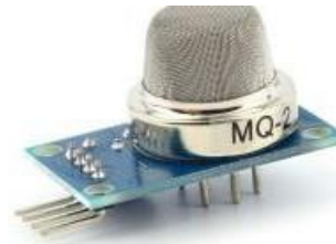
Fig: Gas Sensor

The sensor is easy to use and can be easily incorporated in a small portable unit.