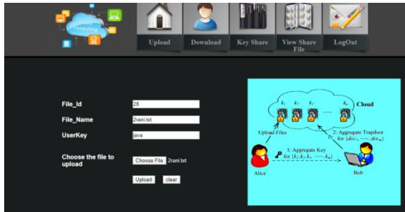
The above figure shows, how to fetch file and decode and create aggregate key for sharing it on cloud.