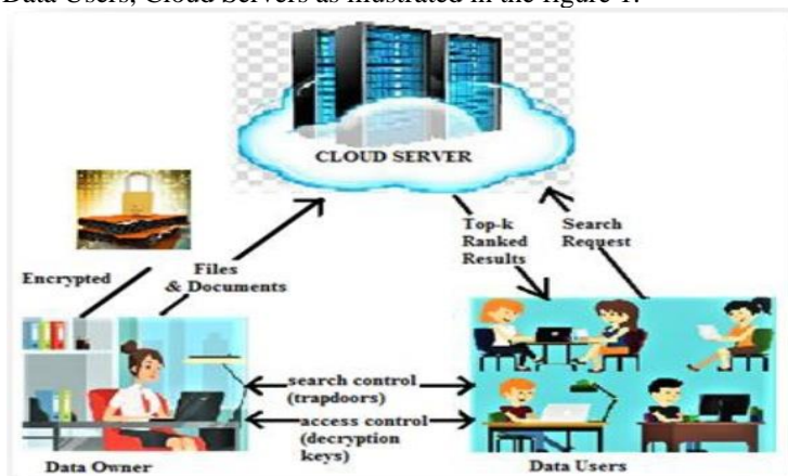
Figure 1 : System architecture of ciphertext data

With the development of various stages for sharing the data's by means of cloud server, cloudlets and so on, the keywords search is necessary to search the files from the cloud storage. To maintain the information safety the security level should be enhanced. The proposed system is designed using three modules namely. Data Owners, Data Users, Cloud Servers as illustrated in the figure 1.